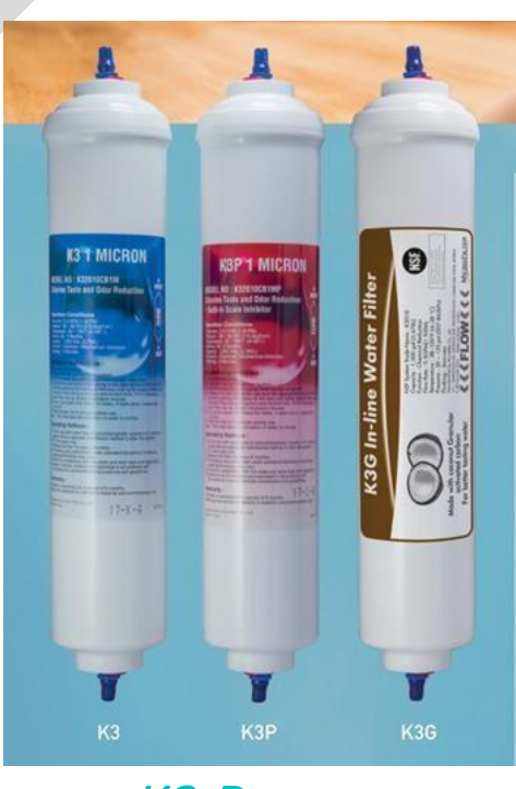
K3 Range March 10, 2021